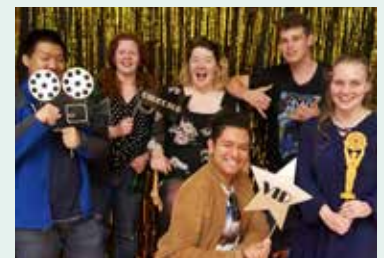
Youth Leading Change